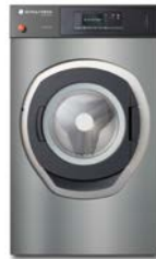
Model Chrome steel