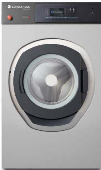
Model Grey matt