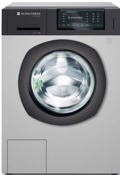
Model Grey matt