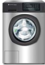
Model Chrome steel